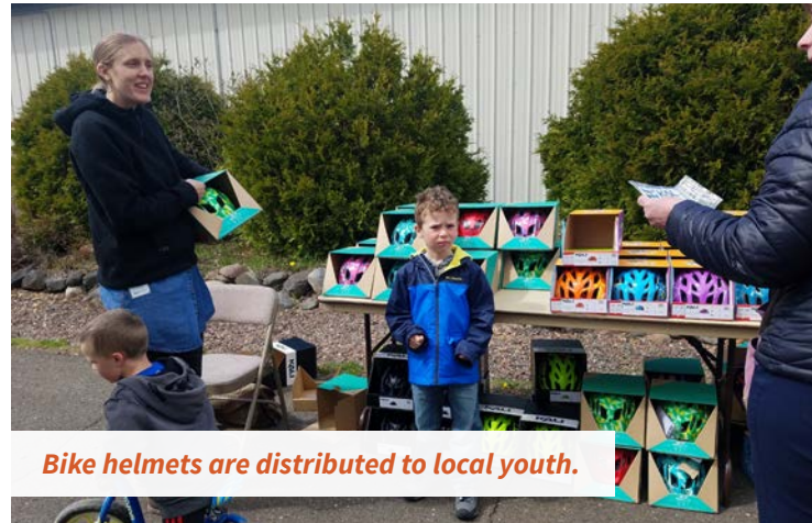
Bike helmets are distributed to local youth.

The SRTS committee was formed in 2009 when the Cook County School District ISD 166 partnered with Great Expectations School, Cook County Highway Department, Public Health and Human Services, Law Enforcement, and the City of Grand Marais to create a plan addressing safety in the school zone for students who are walking, biking, or riding to school.