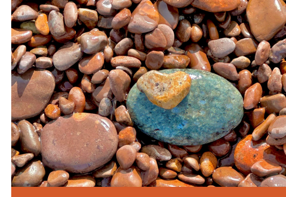
APRIL CALENDAR WINNER Submitted by: Krista Olson